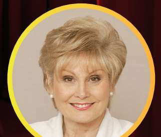
CELEBRITY GUEST Angela Rippon CBE