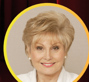
CELEBRITY GUEST 2025 Angela Rippon CBE